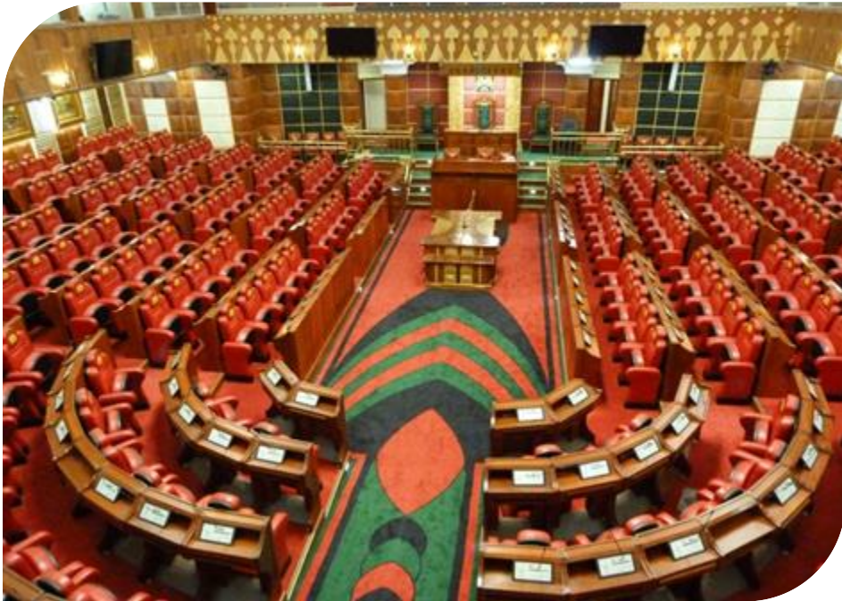
The National Assembly