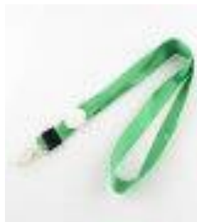
Figure 2B Badge strap